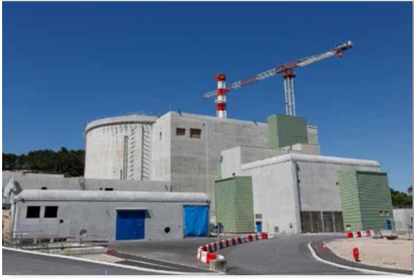
Jules Horowitz Research Reactor, JHR, Cardarache, France